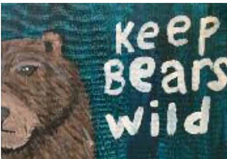
SSPF-sponsored art contest for local schools helped get the word out about living with our Tahoe bears.