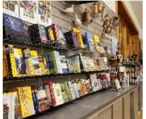
We implemented a new Point-Of-Sale system at the park gift stores.