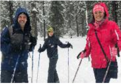
SSPF provided grooming services for the Olympic Nordic trails with free snowshoeing and cross country skiing for hundreds of visitors.