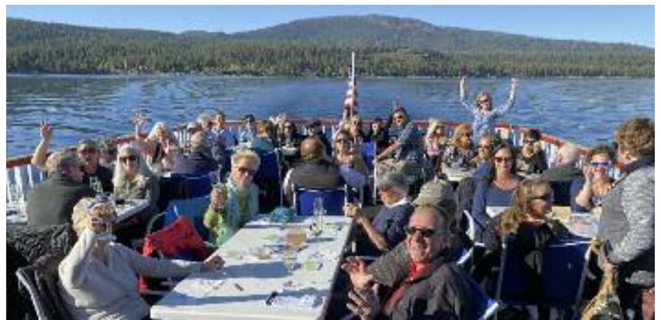
We brought people together at our many fundraising events to support our State Parks. A staggering 58 events connected our parks with the community proving PARKS MATTER!