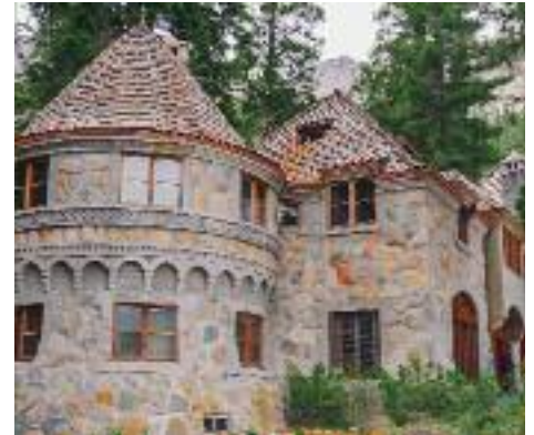
We celebrated the 90th anniversary of Vikingsholm and kicked off the Vikingsholm Forever Endowment Campaign.