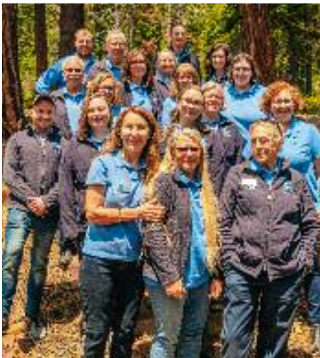
Our dynamic SS PF summer staff enabled us to meet our mission of supporting our state parks.