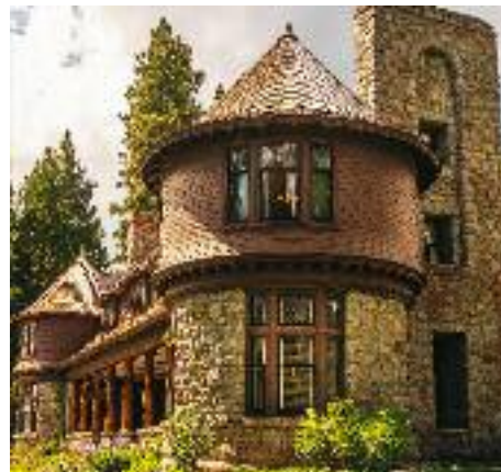
SSPF's professional interpreters lead 30,000 historic house tours at Pine Lodge and Vikingsholm.