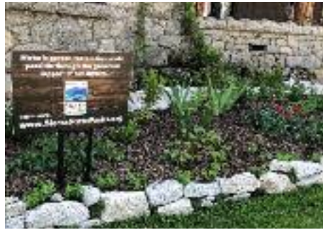
The garden in front of the Hellman-Ehrman Mansion was completely restored and replanted.