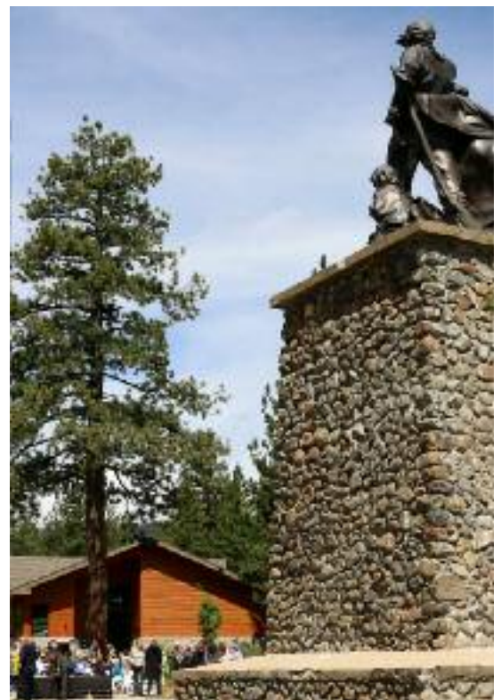
Centennial Celebration of the Pioneer Monument, June 2018

Please consider The Donner Project as legacy giving in your portfolio, host a house party, or help us set up a meeting with decision makers in your giving circle. In memory of our past and in honor of those who follow, please consider this worthy investment in our future.