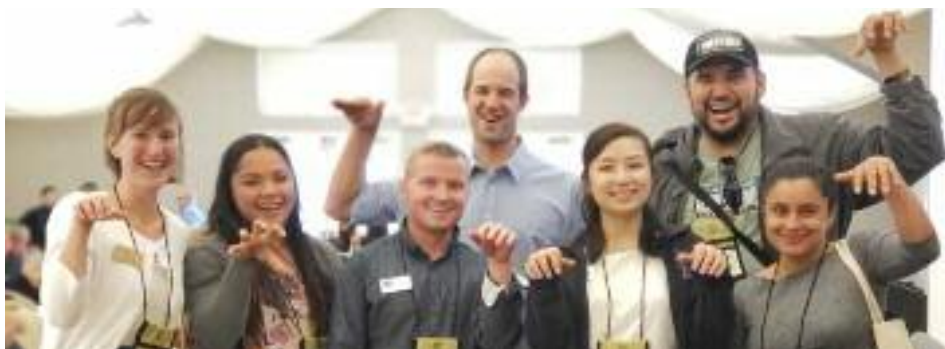
The emerging leaders at the CALPA conference.

In the Sierra State Parks Foundation's mission, it is stated that the goal is to connect visitors with our rich natural resources and cultural heritage. This includes all visitors, and through our efforts, our local California State Parks will continue to be places of education and inspiration for all to enjoy!