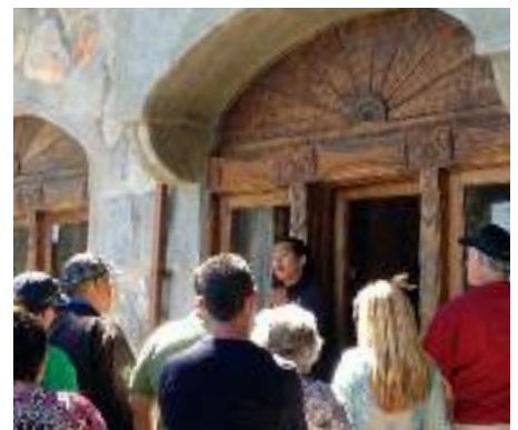
SSPF docent leading tour through Vikingsholm Castle.

Constructed in 1929, Vikingsholm at Emerald Bay State Park is one of the finest examples of Scandinavian architecture in the US. SSPF funded critical restoration and maintenance projects can continue only with our generous and supportive donors. Consider a contribution today to help us maintain this amazing National Historic Landmark.